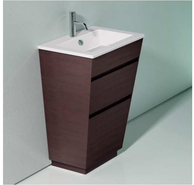
Shown ST0582DR-V09 Wood Veneer finish with optional 158ST00 washbasin